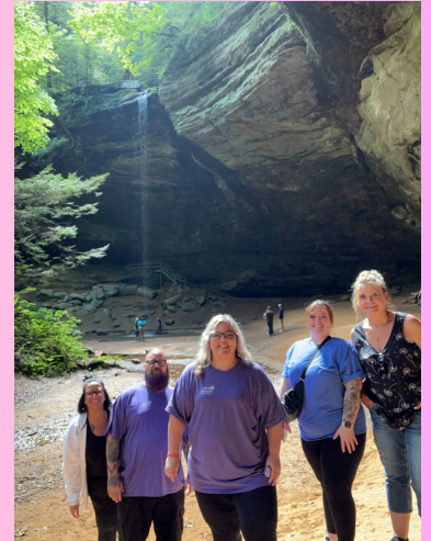
Staff Retreat to Hocking Hills.

Amazing to see God's creation and just take it all in. Everyone needs self care, it was a great time. Thank you to our volunteer that held down the office for us to have a day away!